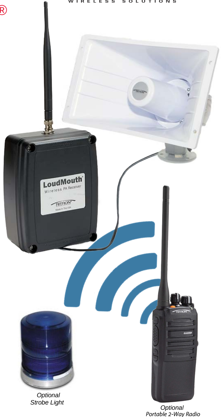
Optional Strobe Light