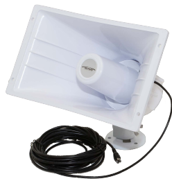
Additional PA Horn Speaker