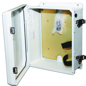
Weatherproof fiberglass housing