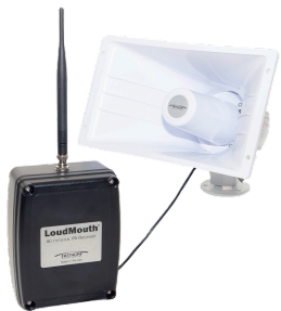
Wireless PA System