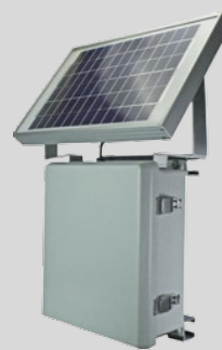
Solar Power Kit