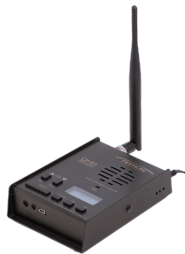
Desk-Top Base Station