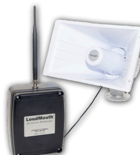
Loudmouth Wireless PA Stand-alone Mass Notification System. Make PA Announcements using your 2-way radio