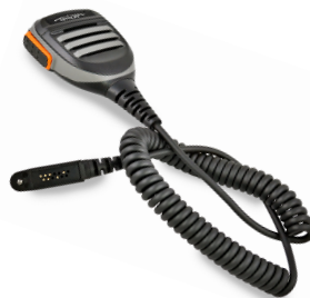
RSM-11HR Remote Speaker Mic