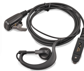
RHD-17X Earset Lapel Mic