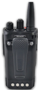
Slide On/Off Battery Pack & Spring-Action Belt Clip