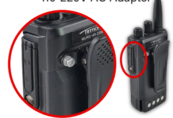
Multi-Pin Audio Accessory Jack

Each Radio Includes: Flex Antenna, Spring-Action Belt Clip, Rechargeable Battery, Drop-in Charger Stand & 110-220V AC Adapter