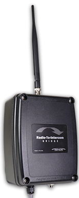
Radio-to-Intercom Bridge Make PA announcements through your wired PA System with your 2-way radios