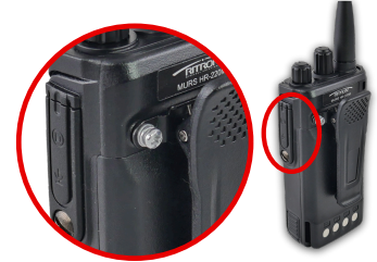
Multi-Pin Audio Accessory Jack

BC-6PR-KIT 6 Unit Charger Kit. DOES NOT include individual radio charging stands. Charging stands come standard with each HR Series radio.