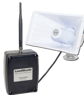
Loudmouth Wireless PA Stand-alone Mass Notification System. Make PA Announcements using your 2-way radio