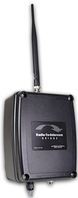
Radio-to-Intercom Bridge Make PA announcements through your wired PA System with your 2-way radio