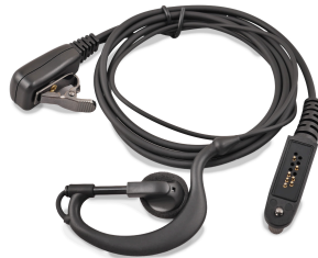
RHD-17X Earset Lapel Mic